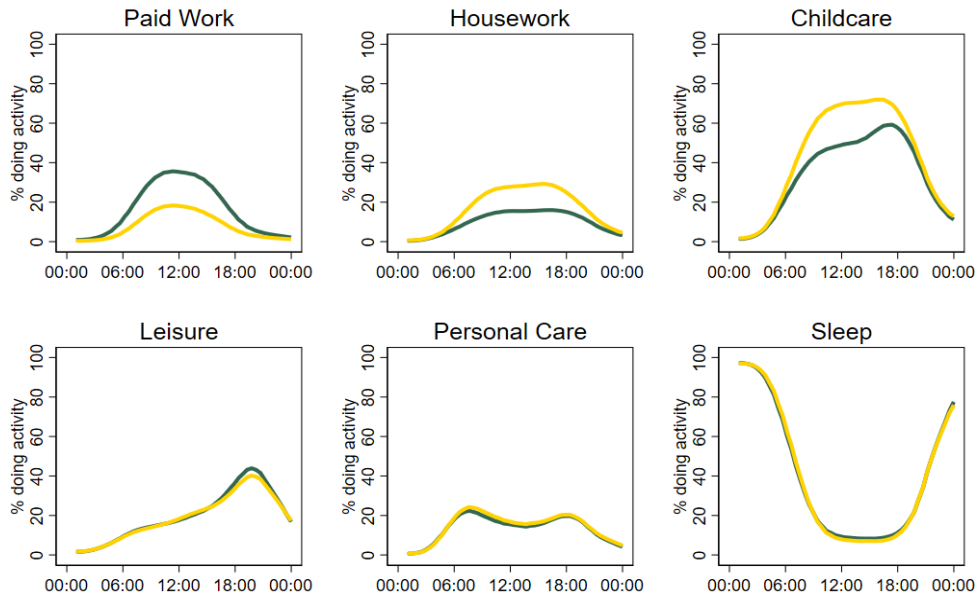
a) During the lockdown (May 2020)