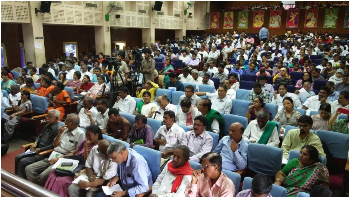
Figure 5: Activists at the 'People's convention' in Hyderabad (IndustriAll 2017)

characterised by civil society actors' rationalised language and retiring stance (Del Felice 2012, 320-321).