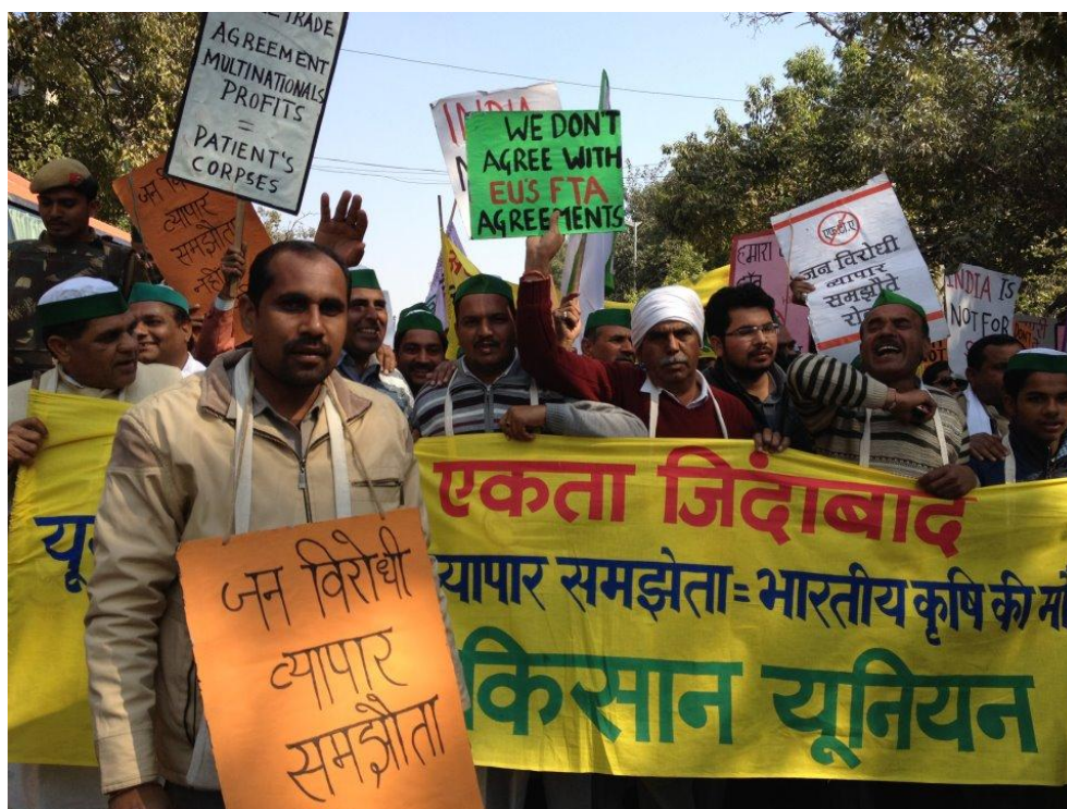
Figure 3: Farmers belonging to Bharatiya Kisan Union demonstrating against the Bilateral Trade and Investment Agreement in New Delhi (La Via Campesina 2012)

Activists from the Right to Food Campaign also consider agricultural liberalisation as detrimental to food security in India. According to them, the BTIA and RCEP have an impact on the amount and quality of the food at the disposal of India's population. Agricultural liberalisation can imply a shift toward cash crops for export (cotton, soya, castor oil, gherkins) at the expense of nutritious staples (pulses, millet) (D. Sinha). Civil society actors also feared food imports of low nutritional value: