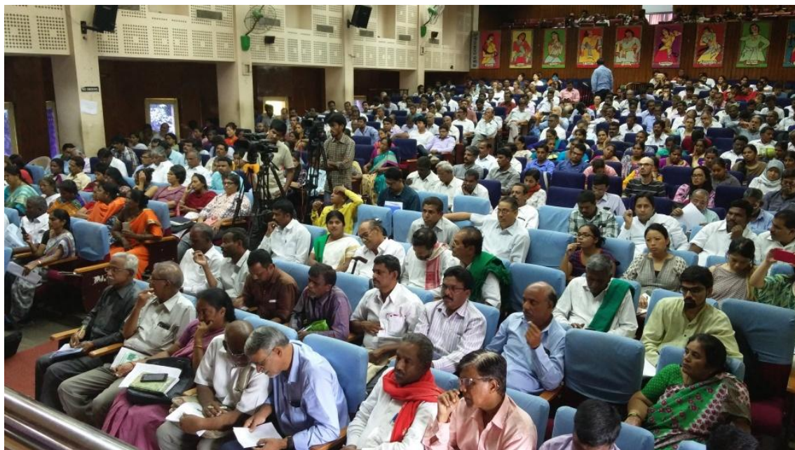
Figure 5: Activists at the 'People's convention' in Hyderabad (IndustriAll 2017)

characterised by civil society actors' rationalised language and retiring stance (Del Felice 2012, 320-321).