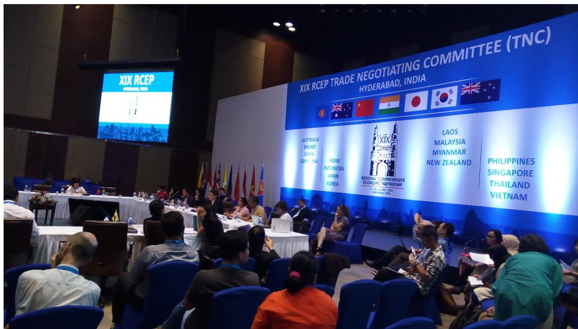
Figure 1: Activists at the consultation held during the 19 th negotiating round for the Regional Comprehensive Economic Partnership (Don't trade our lives away 2017)

Almost completely excluded from the formal arenas of negotiation for the BTIA and RCEP, activists were also confronted with the lack of access to formal documents such as draft chapters of the agreements and impact analyses. A collaboration with activists engaged against free trade agreements abroad allowed civil society actors in India to address this issue (S. Bhutani). According to Pomeroy (2016, 721), alliances between activists from different countries are indeed a common strategy in order to overcome ‘an asymmetry of information between diplomatic representatives and non-governmental actors’. bilaterals.org , a platform created in 2004 as a response to the global increase in bilateral free trade agreements, also provided civil society actors with both formal and non-formal texts. As a ‘collaborative clearinghouse on the internet where people [can] find and post their own information and analysis about bilateral free trade agreements’ (‘About Bilaterals.Org’ 2015), bilaterals.org can be described as ‘a hyper-organisation that exist[s] mainly in the form of [its] website, e-mail traffic, and linked sites’ and amplifies activists’ capacities of mobilisation (Bennett 2005, 218). Civil society actors thus gained access to leaked chapters from the BTIA and RCEP, although such documents are often out of date (S. Barria) and do not cover all the areas of the negotiations (S. Gupta). Activists also criticised the technical character of formal texts: