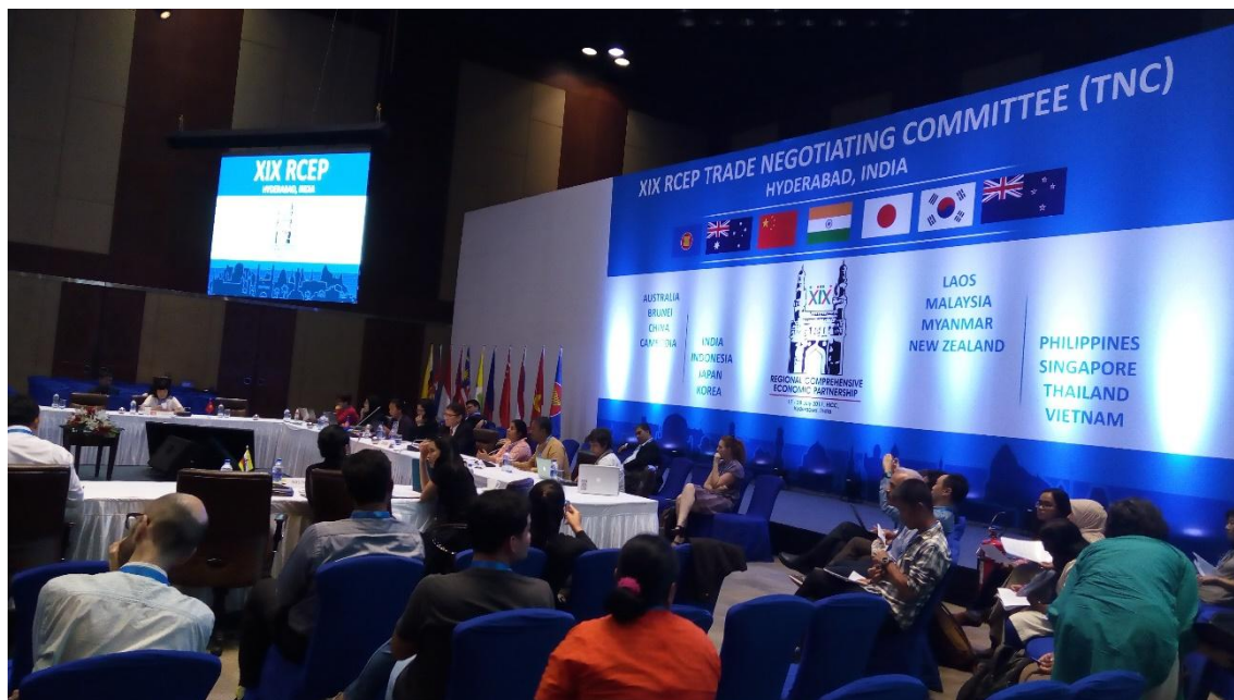
Figure 1: Activists at the consultation held during the 19 th negotiating round for the Regional Comprehensive Economic Partnership (Don't trade our lives away 2017)

Almost completely excluded from the formal arenas of negotiation for the BTIA and RCEP, activists were also confronted with the lack of access to formal documents such as draft chapters of the agreements and impact analyses. A collaboration with activists engaged against free trade agreements abroad allowed civil society actors in India to address this issue (S. Bhutani). According to Pomeroy (2016, 721), alliances between activists from different countries are indeed a common strategy in order to overcome ‘an asymmetry of information between diplomatic representatives and non-governmental actors’. bilaterals.org , a platform created in 2004 as a response to the global increase in bilateral free trade agreements, also provided civil society actors with both formal and non-formal texts. As a ‘collaborative clearinghouse on the internet where people [can] find and post their own information and analysis about bilateral free trade agreements’ (‘About Bilaterals.Org’ 2015), bilaterals.org can be described as ‘a hyper-organisation that exist[s] mainly in the form of [its] website, e-mail traffic, and linked sites’ and amplifies activists’ capacities of mobilisation (Bennett 2005, 218). Civil society actors thus gained access to leaked chapters from the BTIA and RCEP, although such documents are often out of date (S. Barria) and do not cover all the areas of the negotiations (S. Gupta). Activists also criticised the technical character of formal texts: