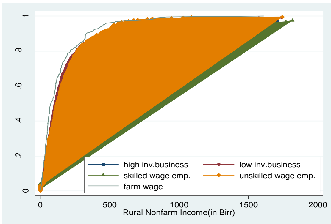
Figure 1 Comparison of income from off-farm activities