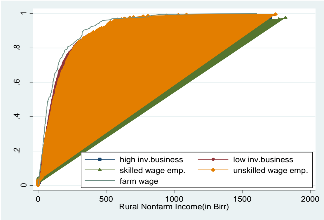
Figure 1 Comparison of income from off-farm activities