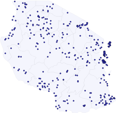
Figure A1: Enumeration Areas from NPS1 2008/09