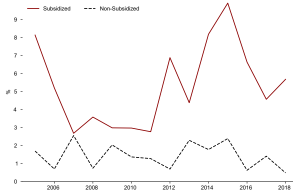
Figure 2: VC Investments by Founding Cohorts