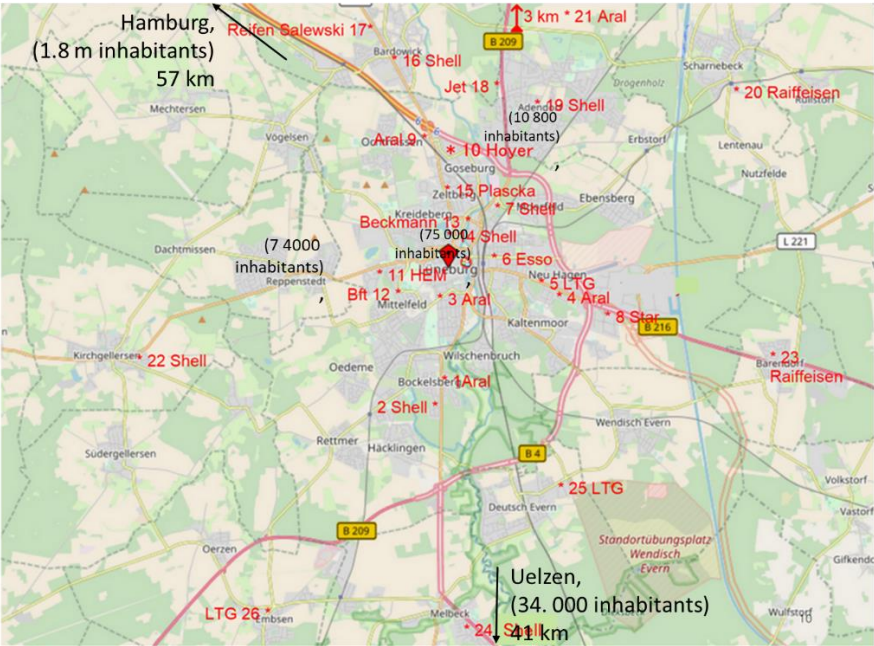
Figure 2: Filling stations -Region of Lueneburg versus Germany ( https://www.openstreetmap.de/karte.html )

The incentives of a service station to be the first to lower its price must be measured in the context of an appropriate market definition. In this paper, the 15 service stations located in the city of Lüneburg (around 75,000 inhabitants) and the eleven service stations in neighboring municipalities are combined to form a local market (Figure 2). Two petrol stations (Aral Brietlingen, No. 21, and Raiffeisen Barendorf, No. 23) ceased operations in the course of 2019. The city of Lueneburg and neighboring villages such as Adendorf (10,800 inhabitants) or Reppenstedt with 7,400 inhabitants certainly represent the major part of the demand for gasoline. The next bigger cities like Uelzen with about 34 000 inhabitants or Hamburg with 1.8 m are far away (41 and 57 km respectively). The freeway ends in Lueneburg and two federal highways cross the Lueneburg city area. In terms of traffic, therefore, relatively little through traffic is to be expected, which has little influence on the demand for fuels. In this respect, a locally dominated market is more likely.