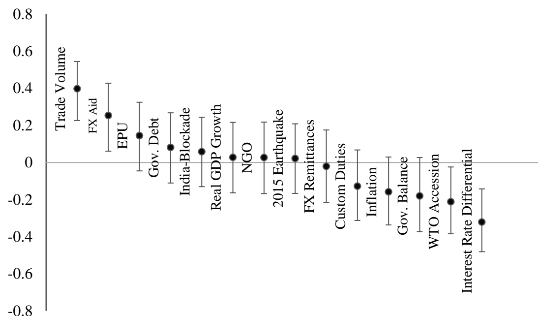
Figure 2: Bivariate Correlations with TMI

Note: Dots represent bivariate Pearson correlation coefficients between our capital flight trade misinvoicing (TMI) measure and the respective variables. Bars indicate 90% confidence intervals calculated using Fisher's z transform. See Appendix A for variable definitions and sources.