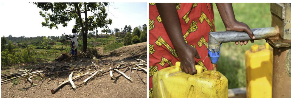
Fig. 1. Woodfuel and water collection practices in Rwanda.

The analysis here examines the costs and benefits of the Tubeho Neza program over a projected period of 5 years and is informed by field survey data, kitchen performance tests and controlled cooking tests, as well as two years of experience with the program implemented at-scale.