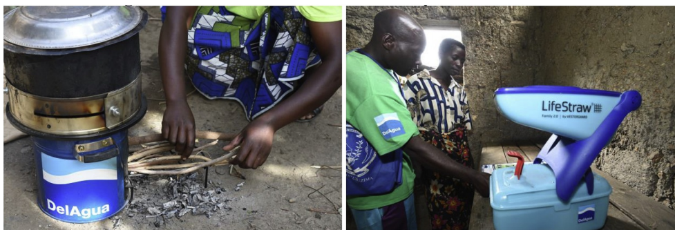
Fig. 2. The cookstove and water filter interventions.

this intervention were examined, including spatial, temporal and demographic characteristics (Fankhauser et al., 2019). This examination indicated that rural households adopted these products at a higher rate than more urban households, and that household adoption was highly correlated to mean community adoption.