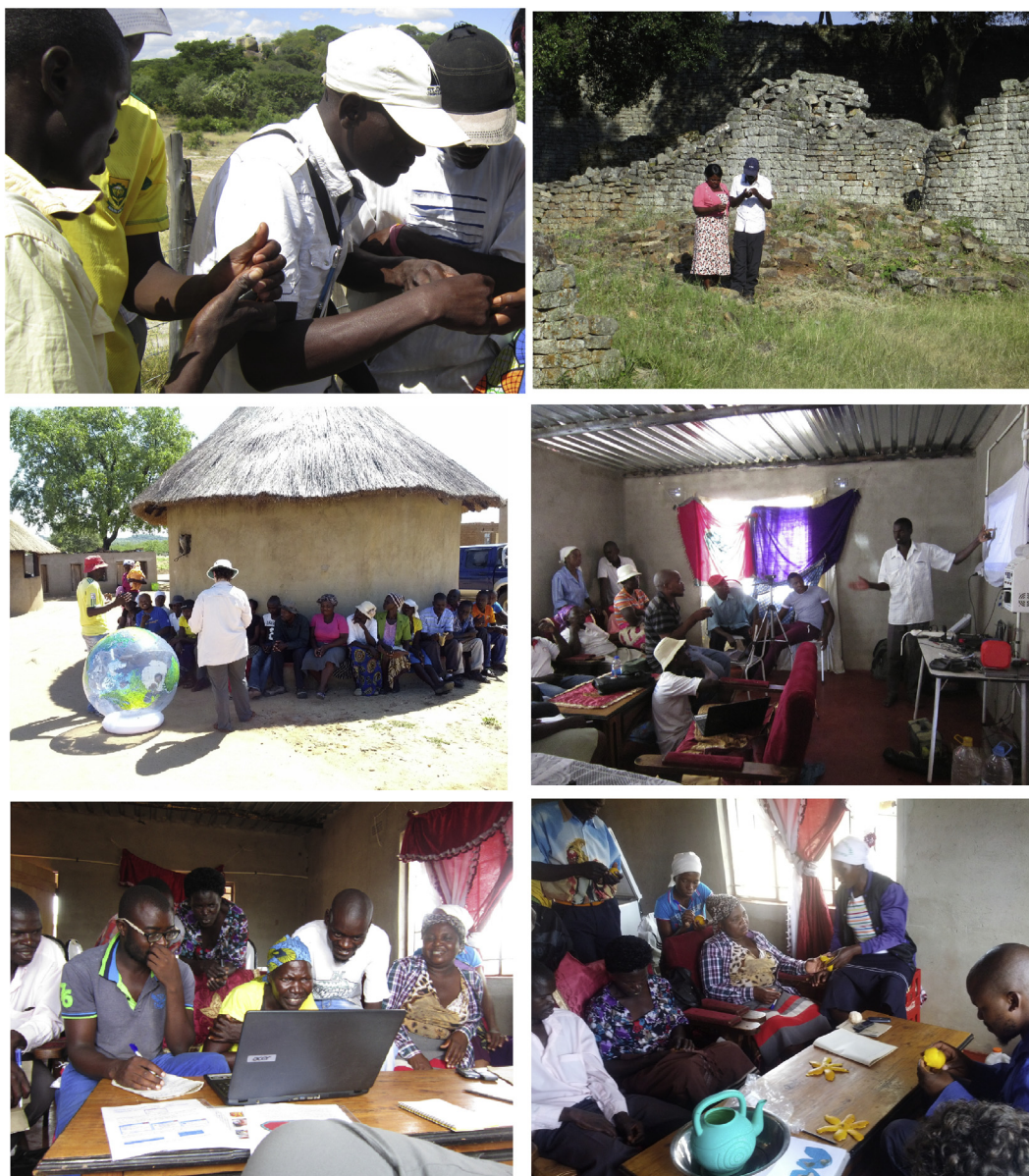
Fig. 2. Muonde GPS team learning to map and teaching mapping. Clockwise from top left: small group instruction in the field with GPS team (initial learners in 2015) explaining how to use Garmin units for recording points to villagers from Madzoke Valley (new learners; also see Table 1 ); field practice at Great Zimbabwe with two GPS team members doing a practical exam of making points and tracks (in 2015); GPS team member(s) explaining maps to the larger Muonde research team during first visit in 2015; GPS team learning about map projections by drawing points on and then peeling oranges to see how flattening a sphere can distort distances (during second visit in 2016) – eating the oranges was a special treat and an incentive to participate; GPS team practicing making maps with QGIS on Acer computer during second visit in 2016 – specifically ensuring that all members were learning the new concepts regarding calculating areas and uncertainties; whole-group instruction with the entire Muonde research team on how satellite work works, A Changarara explaining in Shona what MV Eitzel has just said in English (in 2016).