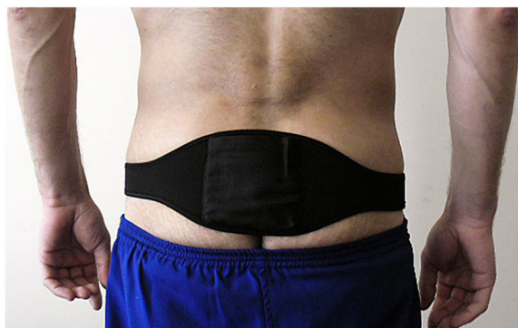
Fig. 1 Dr Allen's Device for prostate treatment comprises an elastic belt and one thermoelement

before starting the treatment and after completing the 6-month treatment (in the treatment groups) and no treatment (in the control groups):