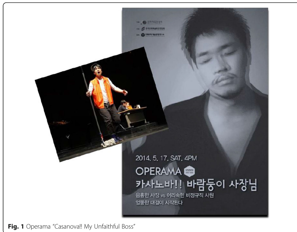
Fig. 1 Operama “Casanova!! My Unfaithful Boss”

metaphor, the characters of this performance are the CEO and temporary employees of a company. Especially, Leporello, the servant from Don Giovanni, has transformed into a custodian and provides the overall commentary of the performance.