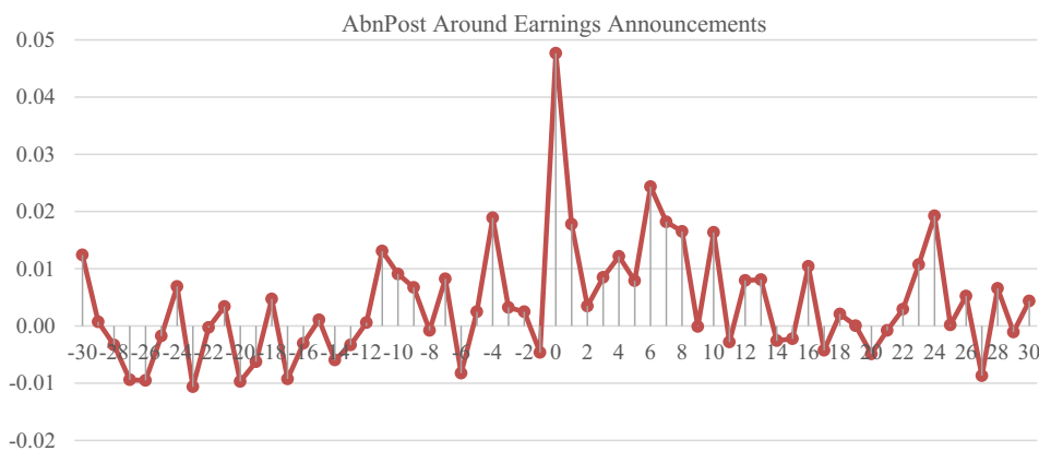
Fig. 2. The average abnormal posting behavior of sample firms around earnings announcements. Day 0 is the earnings announcement day. Abnormal post captures the idiosyncratic posting behavior of companies. AbnPost = \text{Log}(1 + \text{Number of posts on a day by a firm}) - (\text{Average of prior and post 10-week same weekday } \text{Log}(1 + \text{number of posts})) .

EarnPost in this expression is the number of “earnings posts” by a firm on day t, which we identify by means of a text search of around 110 earnings- and performance-related text strings. We identified these text