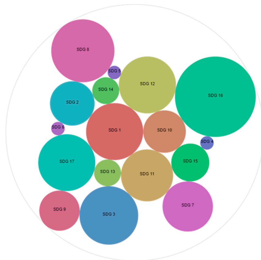
Figure 2. Blockchain projects addressing each SDG.

As shown in Figure 2, SDG 16 (Peace, justice, and strong institutions) topped the list of the SDGs addressed by blockchain projects based on 71 entries listed in the Blockchain Impact Ledger [6].