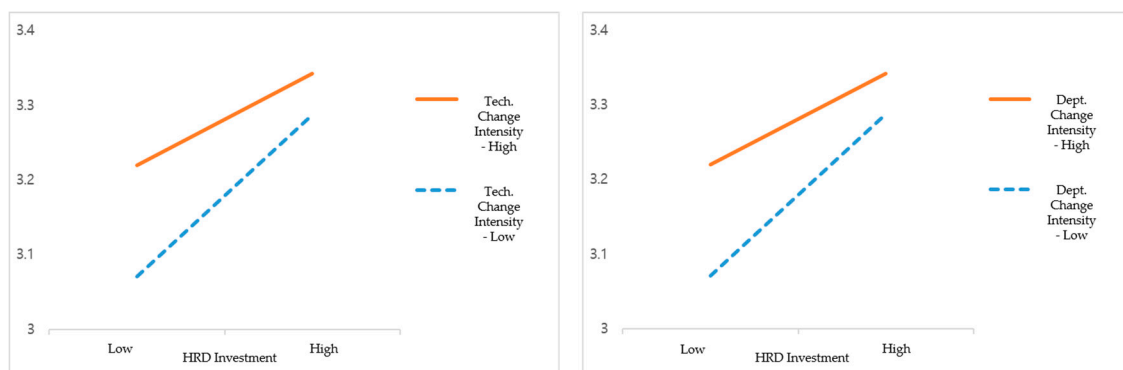
Figure 3. Moderate Effects of the Intensity of Technological (L)/Departmental (R) Changes in Employee HRD Investment: Perceptions of Organizational Innovativeness Relations.