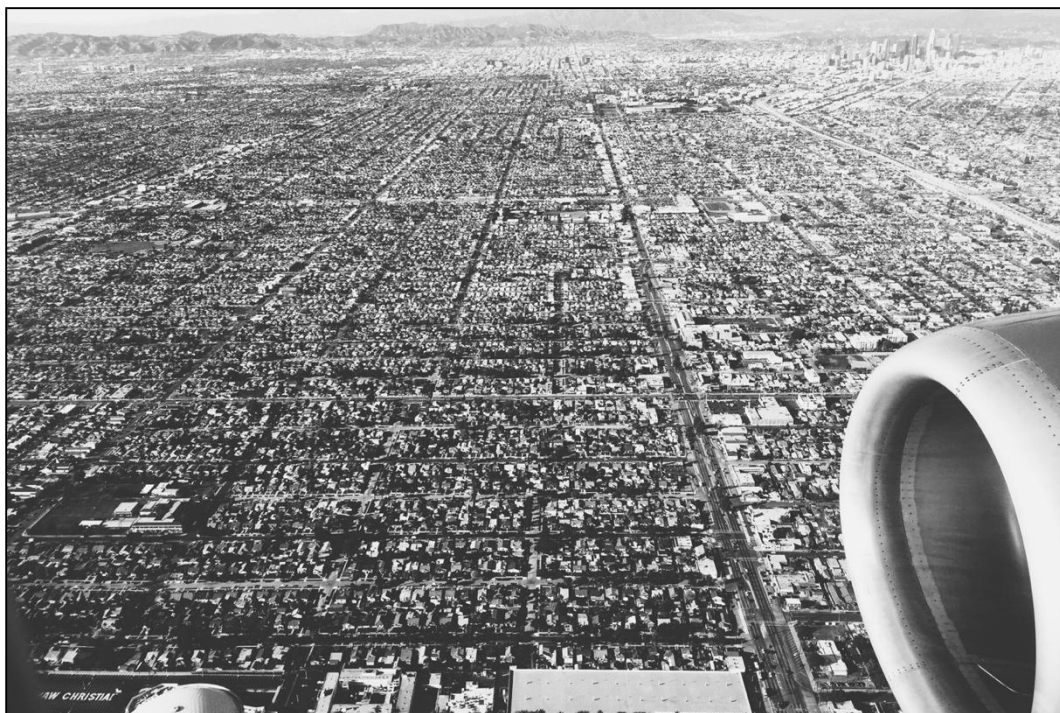
Figure 5. Sprawling development of Los Angeles, 2019.

General Decline of Settlement Densities and Increasing Urban Sprawl: AVs have the natural potential to create an induced urban sprawl—in other words, growth of low-density suburbs (Figure 5). AVs could trigger travel demand (necessary or not) particularly in high motor vehicle dependent societies [69]. They can result in more dispersed and fragmented land uses in the outskirts of cities [70]. This can occur when travel that is more effortless is seen as less of a burden and an invitation to travel more—unless legislators and planners act now. Optimization of accessibility of communities through better land use provision or allocation is required to discourage sprawl.