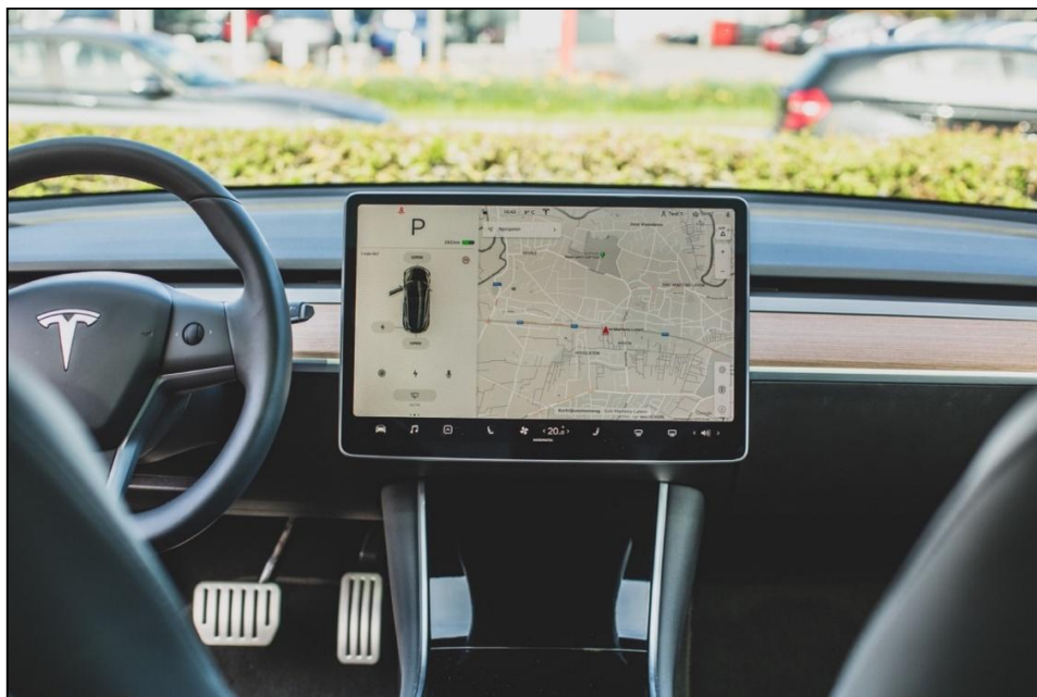
Figure 2. Navigator system control panel of an autonomous vehicle, 2019.