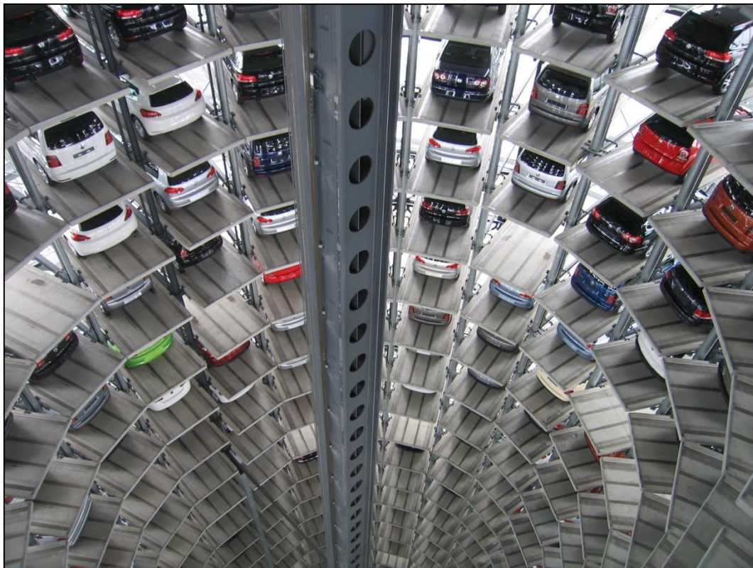
Figure 4. An exemplar parking space complex for autonomous vehicles, 2019.

(or in activity centers) and declines away from these destinations. Hence, it is most likely that parking facilities will be outside the urban core in distributed locations, and they will include daytime or overnight charging facilities at the parking lots. Depending on the location and business models, some of these parking facilities might be in the form of the multi-level parking as in Figure 4. As a result, the requirements to provide obligatory parking spaces in these high-value property areas will need a re-estimation [60]. Reduction in parking lots will transform inner-city areas, as unoccupied parking space will be used for other activities—such as parks or affordable housing. This transformation will allow further realization of mixed-use precincts to trigger the trend of downtown living, creating inner-city areas that are more functional and livable. Meanwhile, some AV charging lots in and out of the city might also be used as mobile office locations. On the other hand, there also exists a pessimistic perspective. Highlighted in a review by Stead and Vaddadi [57], “parking policies will remain as they are (i.e., AVs will use on-road parking spaces). A growth in AV ownership and use leads to an increase in demand for parking spaces in the city. Large numbers of collection/drop-off points are created in the city which add to the amount of space allocated for vehicles” (p. 126).