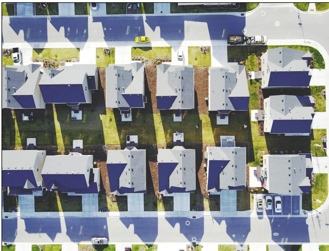
Figure 6. Greenfield development, 2019.

The Environmental Impact of the Use of AVs: The intrinsic technical attributes of AVs appear to be largely favorable in the literature [72]. Moving away from fossil fuel-based energy in electric AVs (given energy is generated from solar, wind or so on) is a positive step to lower the environmental undesired externalities. This is particularly true for AVs' potential for increasing ride-sharing and thus shift personal transportation from individually owned vehicles toward shared-use mobility services [73]. However, increased efficiency and effectiveness of the transport system, as a result of advanced autonomous driving technology, may lead to increased travel speeds and hence increasing greenhouse gas (GHG) emissions [74]. In other words, as stated by Miller and Heard [75], “[i]t is plausible that AVs could become more efficient and GHG emissions could decrease on a functional unit basis (i.e., per-passenger-mile), while overall transport-related GHG emissions increase as vehicle miles traveled (VMT) increase” (p. 6119). Increased mobility and travel convenience could lead to urban sprawl and a rapid expansion of the urban footprint—that is a contributor to the changing climate [76]. Besides the environmental harm of greenfield developments—converting green or agricultural land into urban land uses (Figure 6)—it induces additional GHG emissions due to long travel distance.