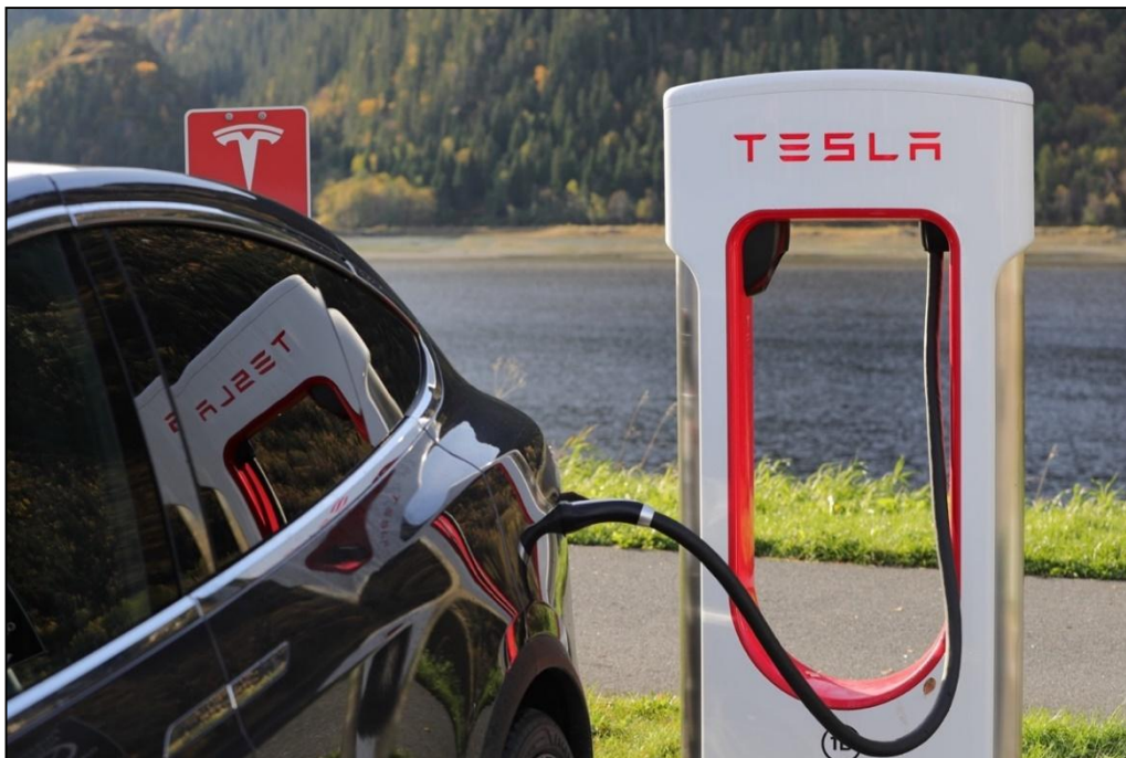
Figure 3. An electric autonomous vehicle charging, 2019.

AVs include automobiles, trucks, drones, ferries, and ships that are driverless or self-driving. Autonomous mobility has evolved incrementally over decades employing many different technologies for steering, navigation, collision avoidance, and maneuvering that will culminate in fully autonomous systems in the next few years. Some elements of AVs have been in use for many years while others are just entering the market. A further implication of the introduction of AVs depends on the power source used, with many AVs being electric (Figure 3) rather than gasoline/diesel, so a shift to AVs may also herald a shift in vehicle energy sources [44]. When summed, however, the set of technologies offers the potential for a vehicle to move and navigate through traffic with no driver assistance.