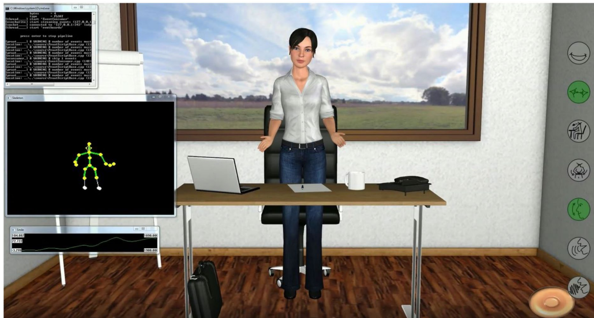
FIGURE 2 Screenshot of the experimental video when the interviewer greeted the applicant. The virtual interviewer was present in the center of the screen for the entire video. On the right side, signal lights provided feedback on the applicant's nonverbal behavior (e.g., smile, see first signal light from the top). On the left side, the applicant's skeleton was visible, accompanied by a continuous smile analysis below [Colour figure can be viewed at wileyonlinelibrary.com ]

and colleagues (2017). Twelve of the organizational attractiveness items were taken from Highhouse et al. (2003), and three items were taken from Warszta (2012).