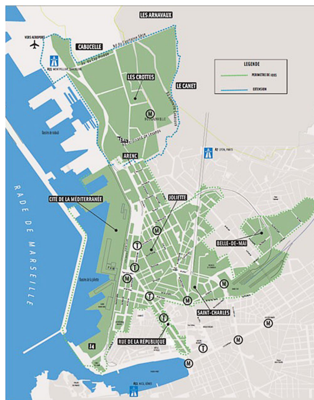
Figure 1 Perimeter of the Operation of National Interest Euroméditerranée in the centre of Marseille – in green on the map (Scale: 1cm: 300 m)

On the political level and in terms of identity, however, this budding metropolis is not just complex but also a continuing source of conflict, teaming with ruptures and entrenched rivalries. Hence, "Marseille, the impossible city" (Viard 1995) or the "unfinished metropolis" (Club d'échanges et de réflexions sur l'aire métropolitaine marseillaise 1994; Chouraqui/Langevin 2000) remain topical to this day. Nonetheless, a process of metropolitan construction has recently begun, based upon certain 'metropolitan catalysts' that we now introduce. Three factors have decisively shaped Marseille's metropolisation processes over the last two decades: Euroméditerranée , the European Cap-