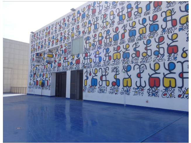
Figure 2 'Panorama'-Tower, Friche de la Belle-de-Mai Art Factory, Perimeter Euroméditerranée

A further dimension in the metropolitan development of the Marseille region was the year-long event MP2013, following Marseille's designation as European Capital of Culture in 2008. During the years preceding its selection, Marseille scarcely seemed suitably qualified or equipped for such