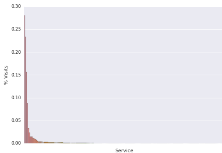
Figure 2: Power-law graph for visits to sharing economy websites

As indicated by the power-law graph in Figure 2, the sharing economy is characterized by a long tail of very small services, and a few services that account for most of the traffic. The distribution is much more skewed than the often-mentioned 80/20-rule: Two services (Amazon mechanical Turk and Airbnb) account for half of the traffic, and six percent of the services account for 90 percent of the traffic. Table 2 describes the 13 services that together account for 89.7 percent of the traffic. Since data were collected in 2016-2017, one of these has closed (the french electric car sharing service autolib).