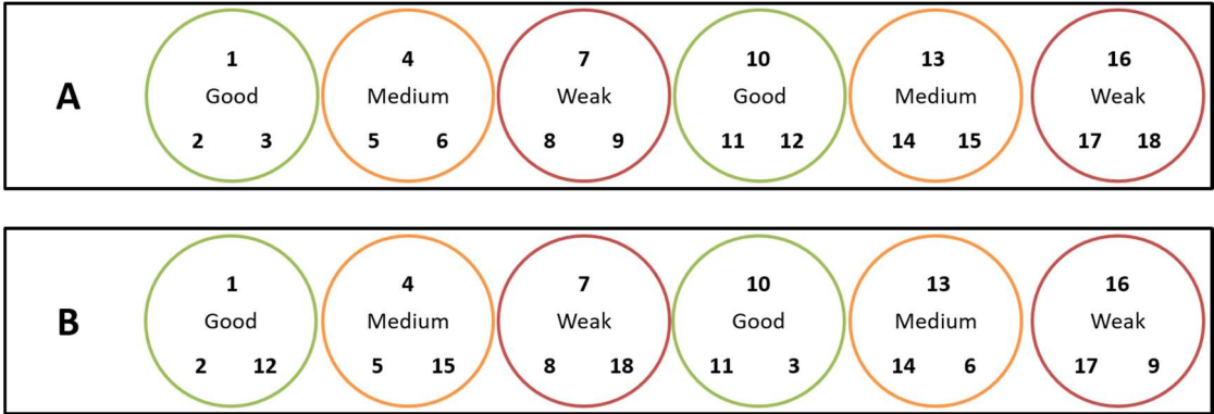
Figure A.1: Cubicle to actual bank type matching

Notes: The first row only shows Banks A, the second shows Banks B. Each circle represents a bank, i.e. a depositor group in the coordination game. Green (Orange, Red) circles represent Good (Medium, Weak) type banks. Depositors are represented by cubicle numbers.