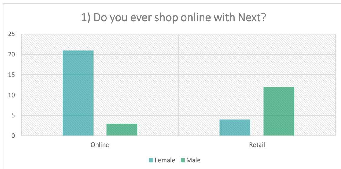
Figure 1. Demographics of respondents to Question 1 and their preferred shopping method.