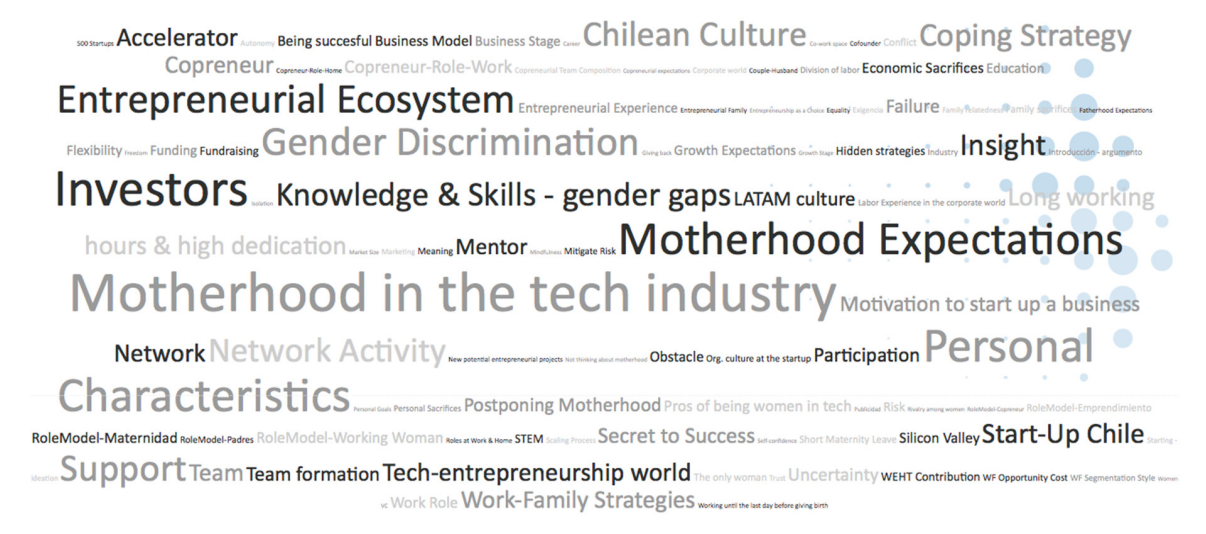
Figure A1. Open coding in a tag cloud.