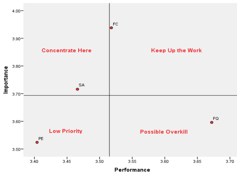
Figure 1. Results of IPA analysis for factors.

While the Y-axis represents the importance scores, the X-axis represents the performance (satisfaction) scores for local cuisine dining experience. The results of IPA analysis for both factors and attributes are provided in Figures 1 and 2, respectively.