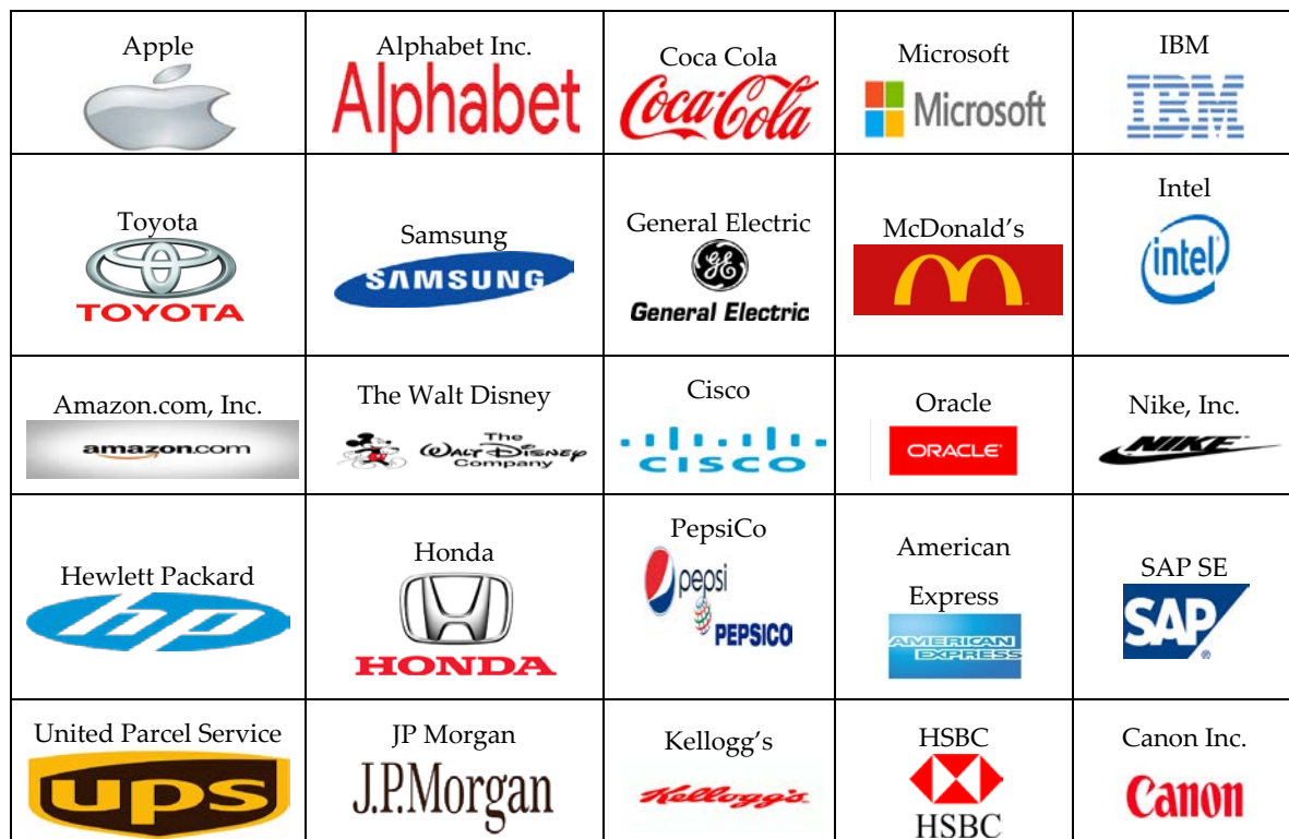
Figure A1. World top branded companies.