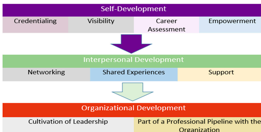
Figure 2. First Attempt at Defining Women's Leadership Levels and Themes.

Initially, our findings at these three levels were indicated by the themes in Figure 2. At the personal level, credentialing, visibility, career assessment and empowerment emerged as themes. At the interpersonal level, networking, shared experience, and support were significant. At the organizational level, cultivation for leadership and being a part of the professional pipeline were central. At that early point in our analysis, we agreed that our professional development was positively impacted by our participation in the WLP program, and that the program was successful in its goal of creating a leadership development opportunity for women at the institution. However, looking back, at this initial stage of our research process, we were in a very guarded, superficial space—both with ourselves and each other.