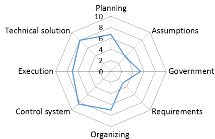
Figure 2. Relative maturity of different aspects of the Barsebäck project at the time of the analysis.