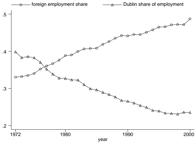
Graph 2: Level of total employment in county Dublin and the rest of Ireland