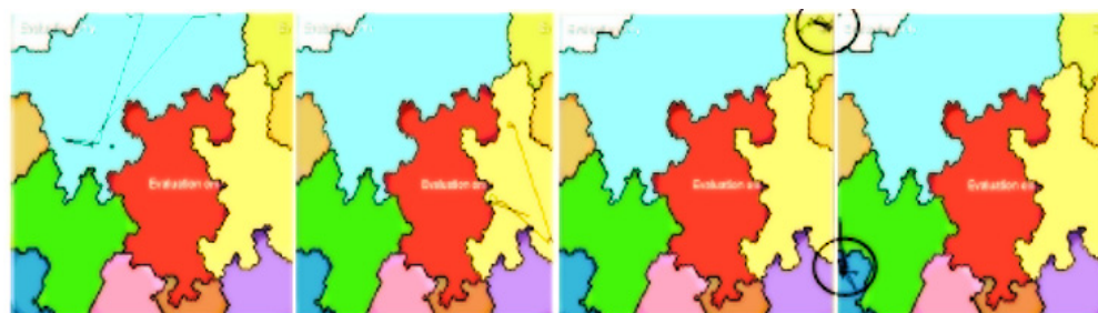
Figure 2. Kohonen topological map of borrowers' scores.

The topological image of the clustering of scores of borrowers is shown in Figure 2. When constructing the Kohonen map for the scoring indicator, the dimensions of the topological map were established (30 × 30).