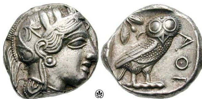
Scheme 1. An Athenian tetradrachm .

Figueira (1998), van Alfen (2011), and Bitros et al. (2020), among others, argued that the so-called Athenian silver drachma became the universal coin in the Eastern Mediterranean because of its purity of silver content, which minimized the risks of performing reliable financial-commercial transactions between Athens and its allies or every other state. The most famous of these series of drachmae issued by the Athenian state silver mint, known as Argurocopeion , was the Athenian tetradrachm (four drachmae) which rapidly became the internationally-accepted leading currency throughout the Mediterranean (Scheme 1).