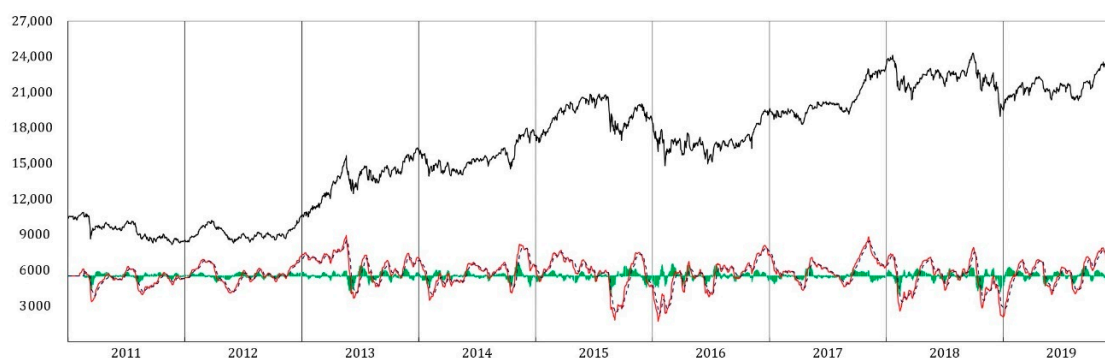
Figure 1. Index Value of Nikkei 225 Futures and MACD (12,26,9) over the past 9 years.

Before examining the empirical results, let us begin with a simple observation on the changes in the trends in the Nikkei 225 Futures values. This will help interpret the results presented below. The thick line at the top of Figure 1 shows how the index changes from 4 January 2011 to 30 December 2019 (which covers 2204 trading days). The bottom three lines show an MACD line (red), a signal line (blue) and a histogram chart (green) for the traditional MACD (12,26,9) model.