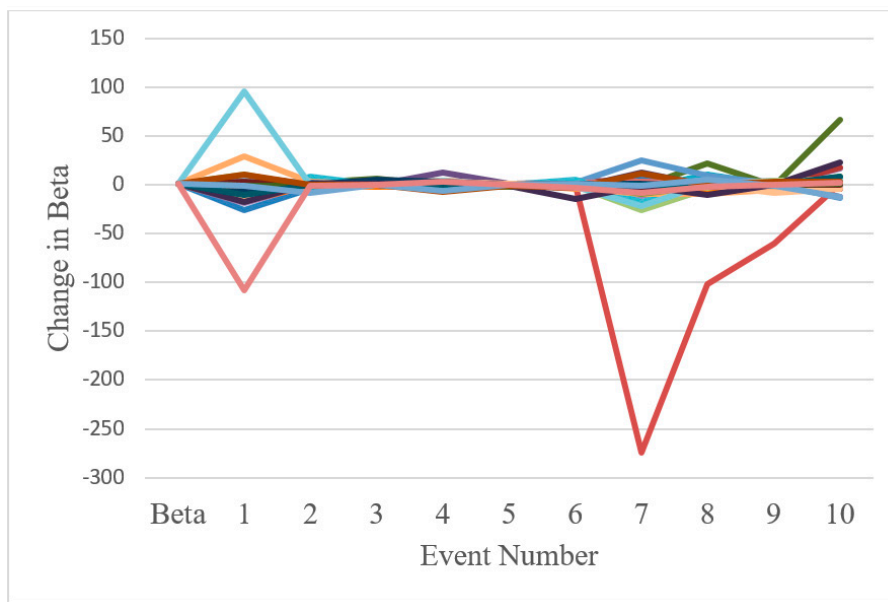
Figure 1. Short-term changes in systematic risk.