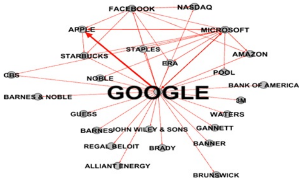
Figure 2. Google 2012 fourth quarter co-occurrence network graph.

Finally, these co-occurrence pairs were aggregated monthly. Figure 2 illustrates co-occurrence pairs extracted from news articles in 2012, fourth quarter. The thickness of links indicates the frequency of co-occurrence.