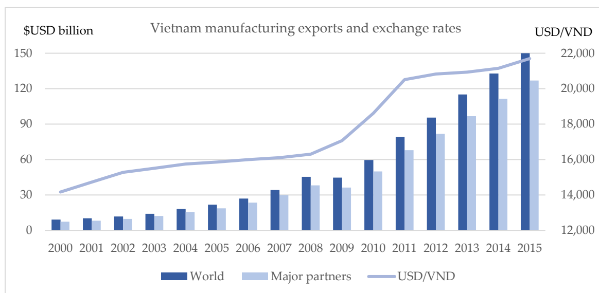
Figure 1. Quarterly Vietnam’s Total Exports and VND/USD.

Figure 1 presents the annual values of Vietnam’s manufacturing exports, and the line depicts the trend in the VND/USD exchange rate from 2000 to 2015. There was an upward trend over the timeframe considered. The total value of manufacturing exports started at around 10 billion USD in 2000, gradually increased to approximately 45 billion USD in 2008, and then had a relatively slight decrease in 2009 because of the global financial crisis. After that, the increase was even more significant during the 2009–2015 period, ending up at over 150 billion USD in 2015. A similar trend was seen in the export pattern of 26 other major countries. Regarding the exchange rates, the line graph shows an upward trend from around 14,000 VND per 1 USD in 2000 to approximately 22,000 VND per 1 USD in 2015, indicating a depreciation in VND of more than 120% over the selected period. The most striking detail is that, after the global financial crisis, the exchange rate depreciated dramatically, with a depreciation of around 30% over a period of three years.