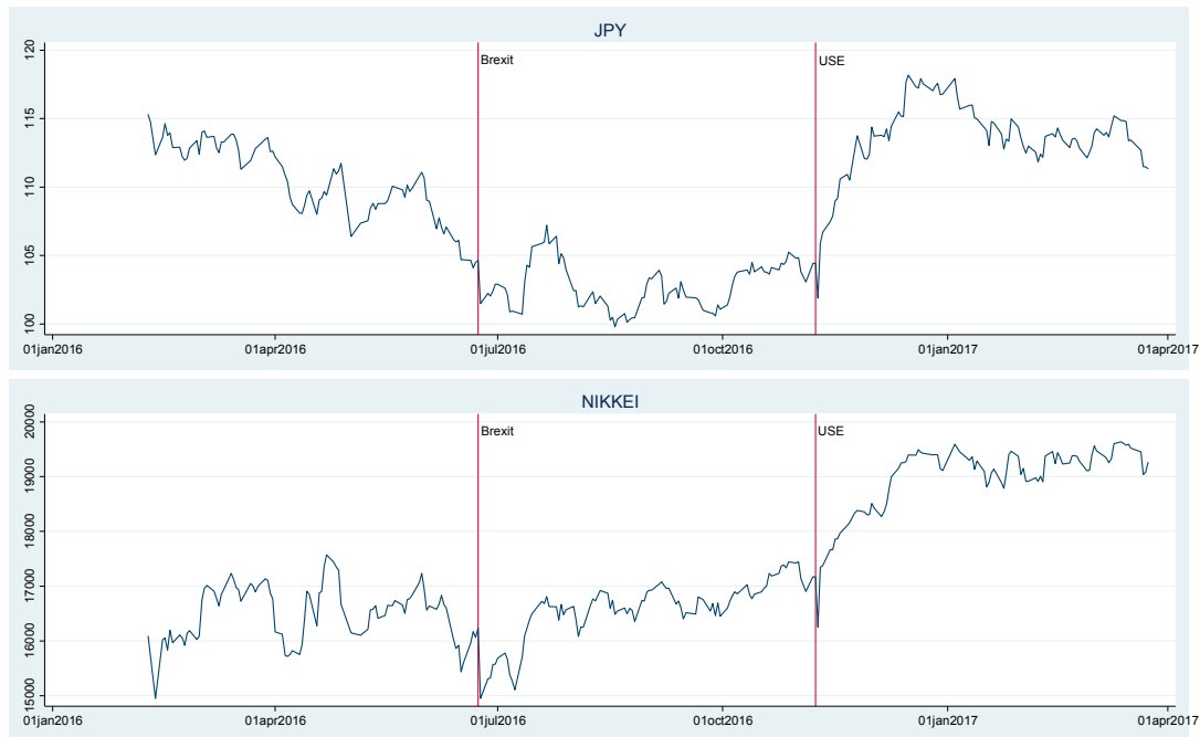
Figure 1. Daily JPY exchange rate and Nikkei closing price index.

presidential election. The returns clearly demonstrate instability in the returns of the JPY and the Nikkei in the days following the referendum and election. Moreover, the returns seem different for each period. The difference in the returns before and after each event could be considered as the effect of the Brexit referendum and the United States presidential election, or as the response of the exchange rate and stock price to information or news about the results of the referendum and election.