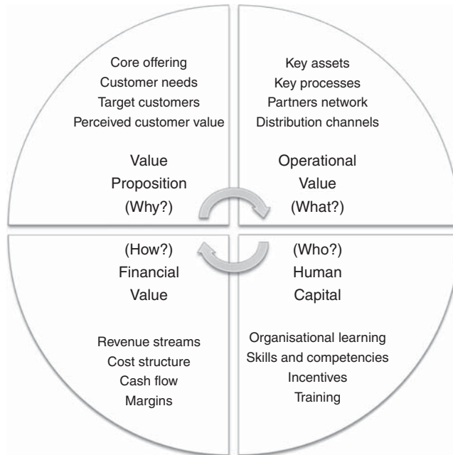
Figure 2. Business model innovation framework

Our framework (Figure 2) integrates all the elements where alternative business models can be explored. This framework does not claim that the listed elements are definitive for high-performing business models, but is an attempt to outline the elements associated with business model innovation. This framework builds on the previous work of