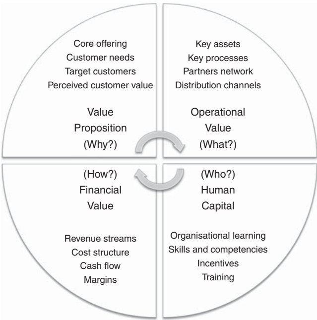
Figure 2. Business model innovation framework

Our framework (Figure 2) integrates all the elements where alternative business models can be explored. This framework does not claim that the listed elements are definitive for high-performing business models, but is an attempt to outline the elements associated with business model innovation. This framework builds on the previous work of