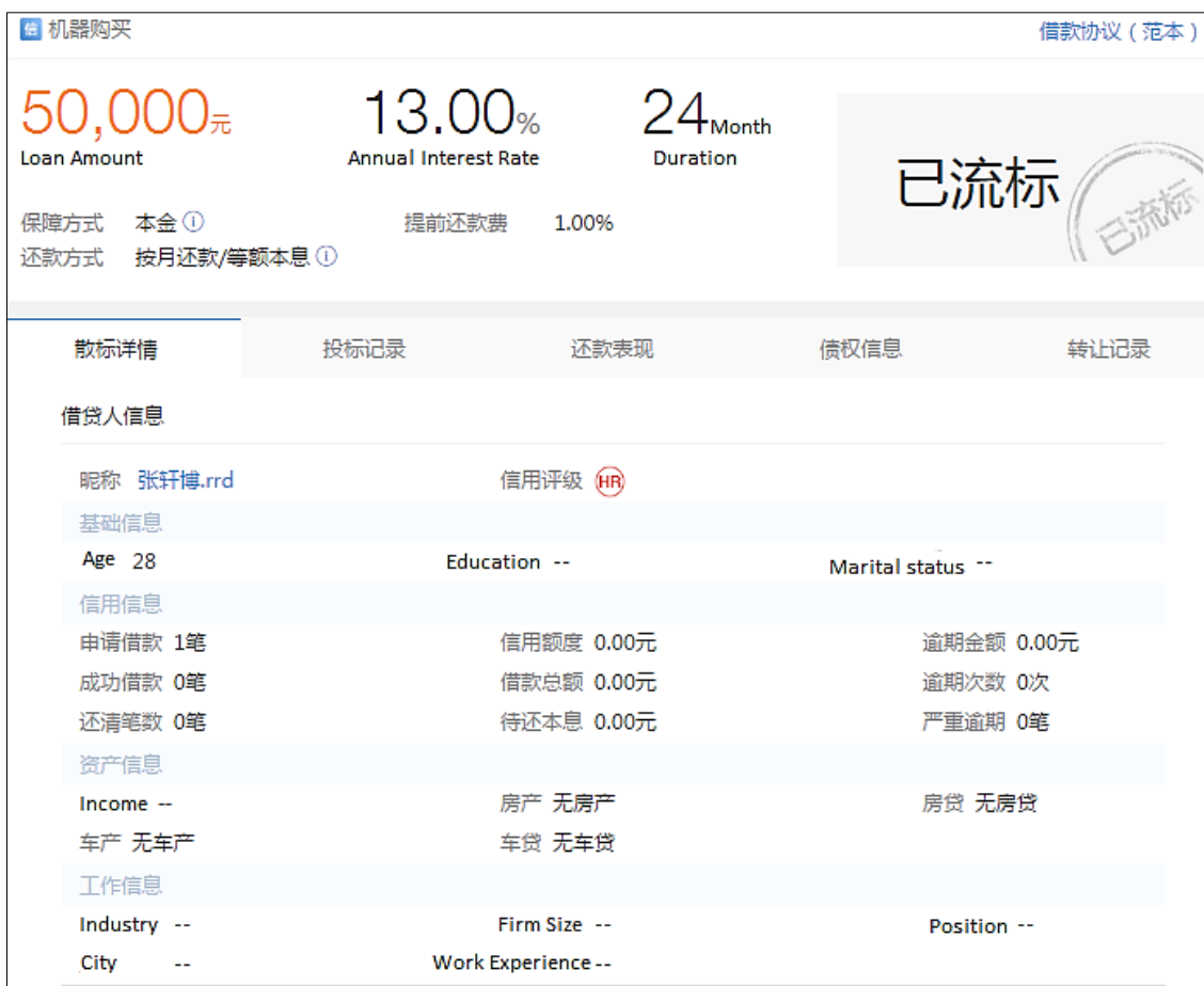
Figure 2: Example Loan Listing on Renrendai.com (Loan ID=469679)