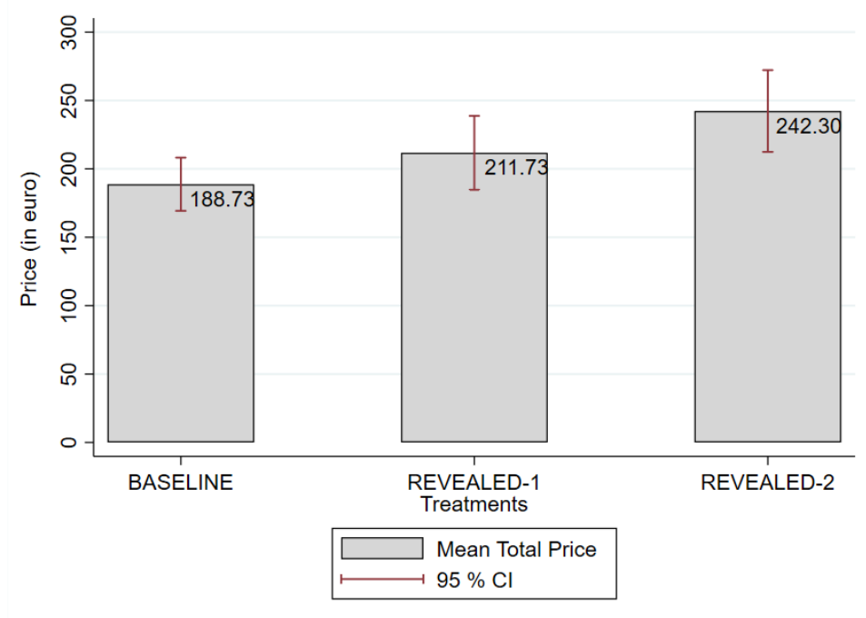
Figure 2: Average repair price conditional on the repair being successful

Notes: Average repair price per treatment in case of a successful repair (N=25 in BASELINE, 23 in the REVEALED-1 treatment, and 27 in the REVEALED-2 treatment, respectively). Average price (in euro) indicated in the top right corner of each bar. Error bars, mean \pm SEM.