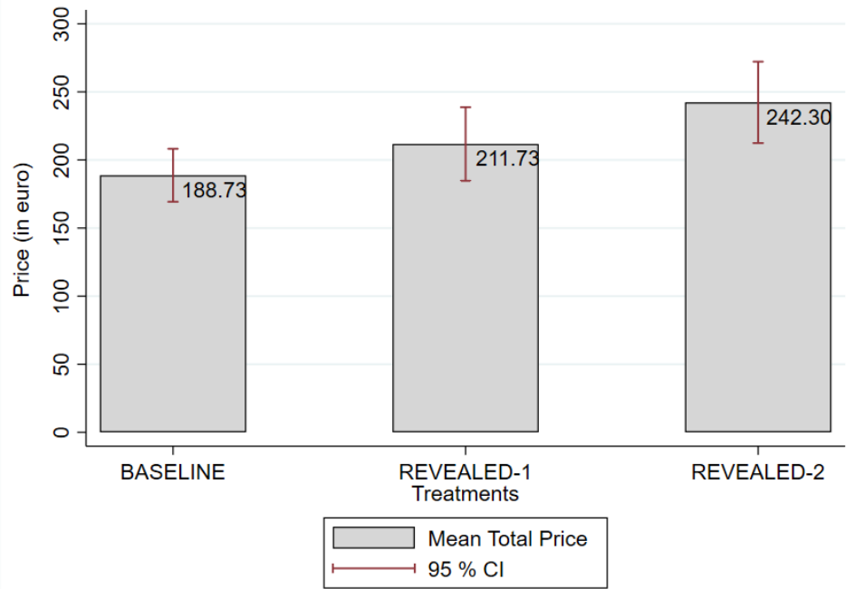
Figure 2: Average repair price conditional on the repair being successful

Notes: Average repair price per treatment in case of a successful repair (N=25 in BASELINE, 23 in the REVEALED-1 treatment, and 27 in the REVEALED-2 treatment, respectively). Average price (in euro) indicated in the top right corner of each bar. Error bars, mean \pm SEM.