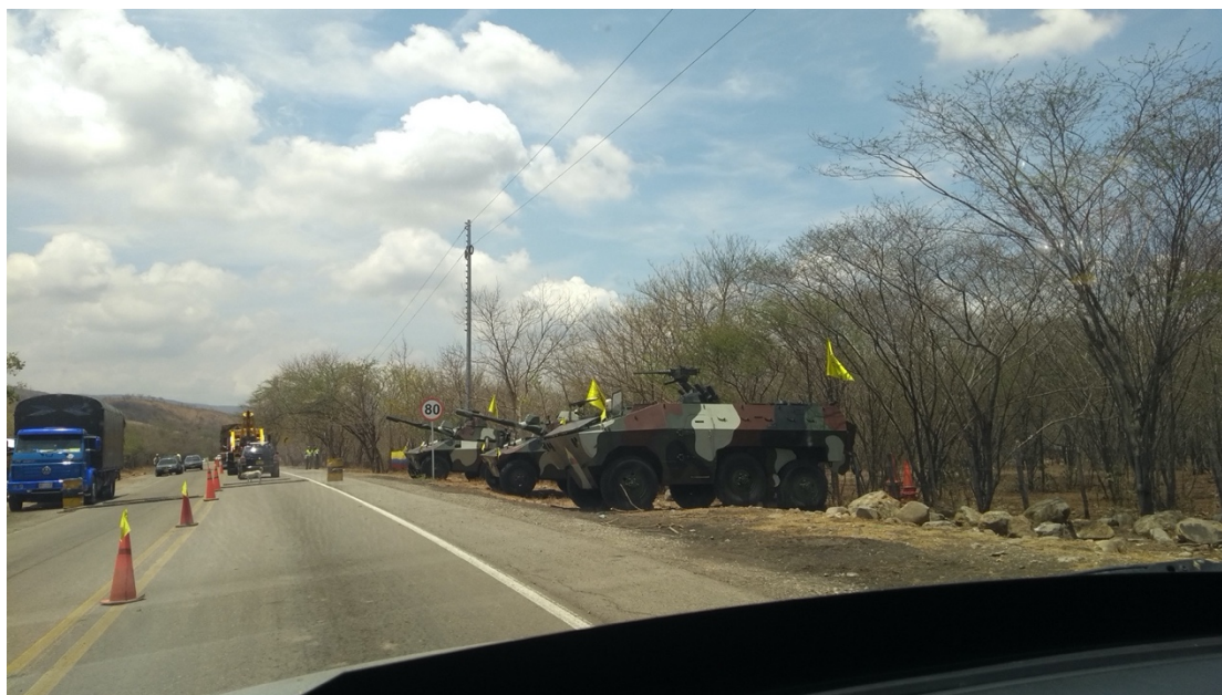
Military vehicles on the main road between Hatonuevo and Barrancas, close to the entrance to the Cerrejón mining complex. May 2019.

between the fenced mining area and Cerrejón's privately owned road, which is also the main publicly used road between the towns of Albania and Maicao. There are also mobile military posts around the area. In 2018 and 2019, when two communities in particular started to mobilize resistance to the diversion of the Bruno stream, a military post was put up in front of the entrance to one of the communities. Community members felt certain that that was no coincidence, and that they had to live with the fact that they, as well as any potential guest of theirs, were being monitored (field notes, April 2019).