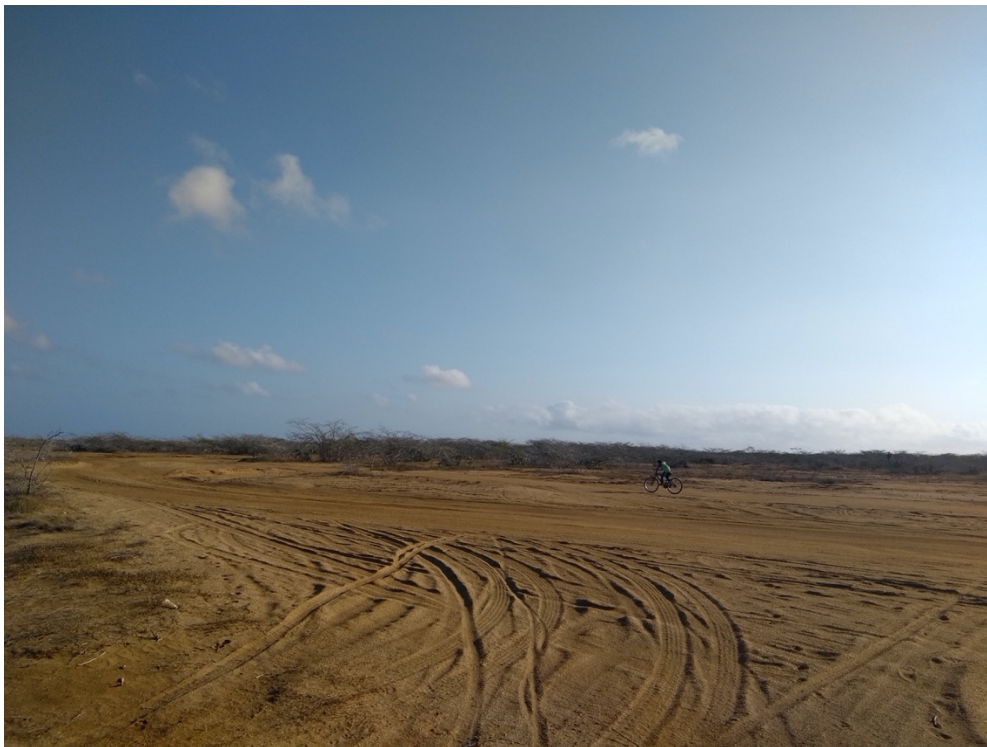
Arid landscape in Media Luna. May 2019.

What this narrative illustrates thus far is that the mining pioneers' perception of their project – to make things ready for the Cerrejón mine – was based on colonial legacies of a quest for civilization, which were used to justify the destruction of local livelihoods and natural infrastructure by promoting the new mega-project as bringing progress and order to what was perceived to be an uncivilized and lawless region. In the next section I will turn to the actual acquisition strategies that were used to engineer consent and acquire the land needed for the huge coal complex and its infrastructure. These strategies build on the same forms of colonial legacies and represent early versions of today's corporate security practices.