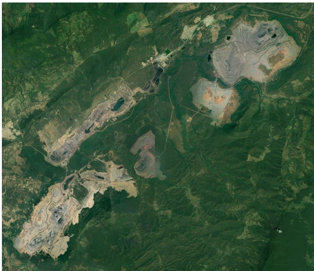
Cerrejón mining pits, satellite photo, Google Earth, 2020.

evictions have taken place, though at a slower pace, and since Tamaquito no entire communities have been displaced. A few communities are currently fearing future displacement, either because they can see the mine getting closer due to its expansion (Manantialito), because the environmental impacts are increasing (Provincial), or because they have received concrete threats to leave the land, private individuals appearing almost out of nowhere and claiming the land to be theirs (Rocío).