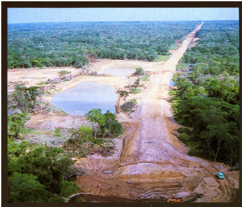
The highway next to the railway that was built around 1983 (Acosta 2012: 17).

In the monotonous and eventless humdrum life of La Guajira described by Acosta, people were 'destined' for a passive fishing life and 'condemned' to observe smugglers doing illegal business without a care. This representation of the time 'before the mine', which repeats the general perception of La Guajira mentioned above, might have been helpful in justifying and glorifying the arrival of this 'lawful megaproject' that would bring progress and order to the area (ibid.). During 1983 and 1985 the coal export terminal, which was three times larger than any other port that so far existed in Colombia, was built in record time. When it was built, the people of Media Luna 'ceased to be passive spectators of the illicit passage of smugglers' and now became 'active witnesses of the arrival of gigantic tugboats' carrying large-scale machinery to La Guajira for the most 'ambitious megaproject of Colombian mining' (Acosta 2012:12).