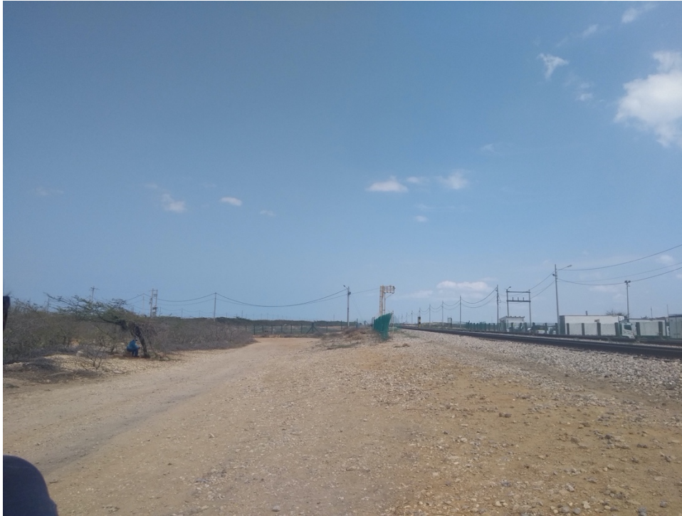
The railway at the point it arrives at the entrance of the port area, in Media Luna.