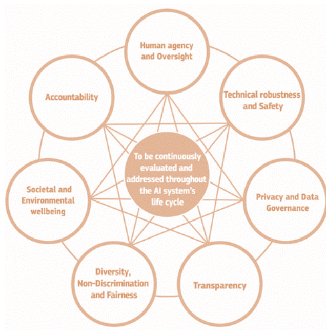
Figure 2. Seven requirements of EU Ethics Guidelines for Trustworthy Artificial Intelligence 22

Following its 2018 “AI for Europe” report, the European Commission has released in April 2019 its “Ethics Guidelines for Trustworthy Artificial Intelligence”, developed by a group of independent experts based the feedback of 500 contributors. These Guidelines’ objective is to “promote Trustworthy AI”, which would be a lawful, ethical, and robust AI: “These guidelines are addressed to all AI stakeholders designing, developing, deploying, implementing, using or being affected by AI, including but not limited to companies, organisations, researchers, public services, government agencies, institutions, civil society organisations, individuals, workers and consumers. Stakeholders committed towards achieving Trustworthy AI can voluntarily opt to use these Guidelines as a method to operationalise their commitment, in particular by using the practical assessment list of Chapter III when developing, deploying or using AI systems. This assessment list can also complement – and hence be incorporated in – existing assessment processes.”