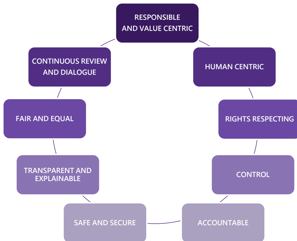
Figure 4. Telia company guiding principles on trusted AI ethics

An example of how platforms tackle harmful content issues is TikTok 46 . The Chinese video sharing platform, created by Douyin for non-Chinese markets and launched in 2016, has published Community Guidelines 47 on violence, hate speech, harassment among others, and its Trust & Safety teams moderate and remove content that is not compliant to these guidelines. TikTok also works on increasing transparency about the reasons why content has been removed in order to inform users “how their actions could be hurtful to others”. TikTok recently joined other platform by signing the EU Code of Practice on Disinformation.