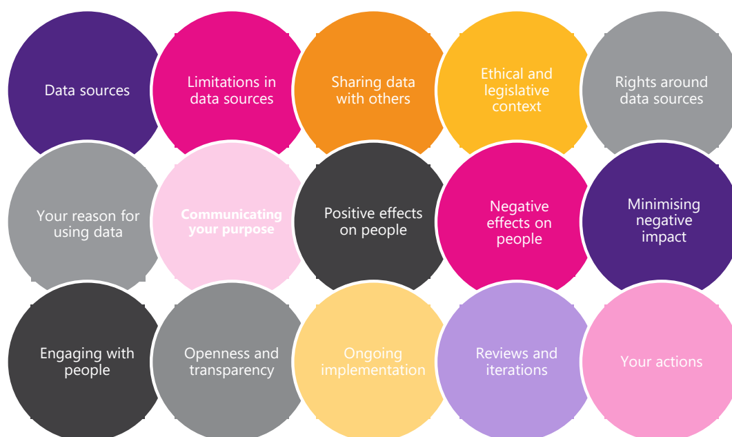
Figure 5. ODI Data Ethics Canvas

company are ethical and checking that the outcomes of algorithms can be trusted and are not biased. The system has been peer-reviewed by tech- and non tech-company experts and is one of the first cases of practical application of AI ethics in industry. Regarding online harms, YouTube has for instance has launched a fact-checking tool that relies on an open network of third-party publishers. 52