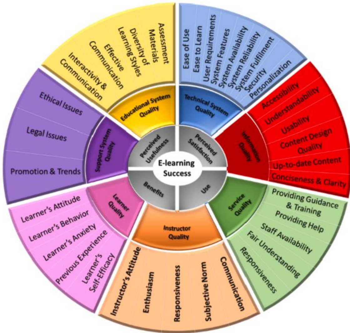
Figure 1. Taken from Al-Fraihat, Joy, Masa'deh, and Sinliar (2020).