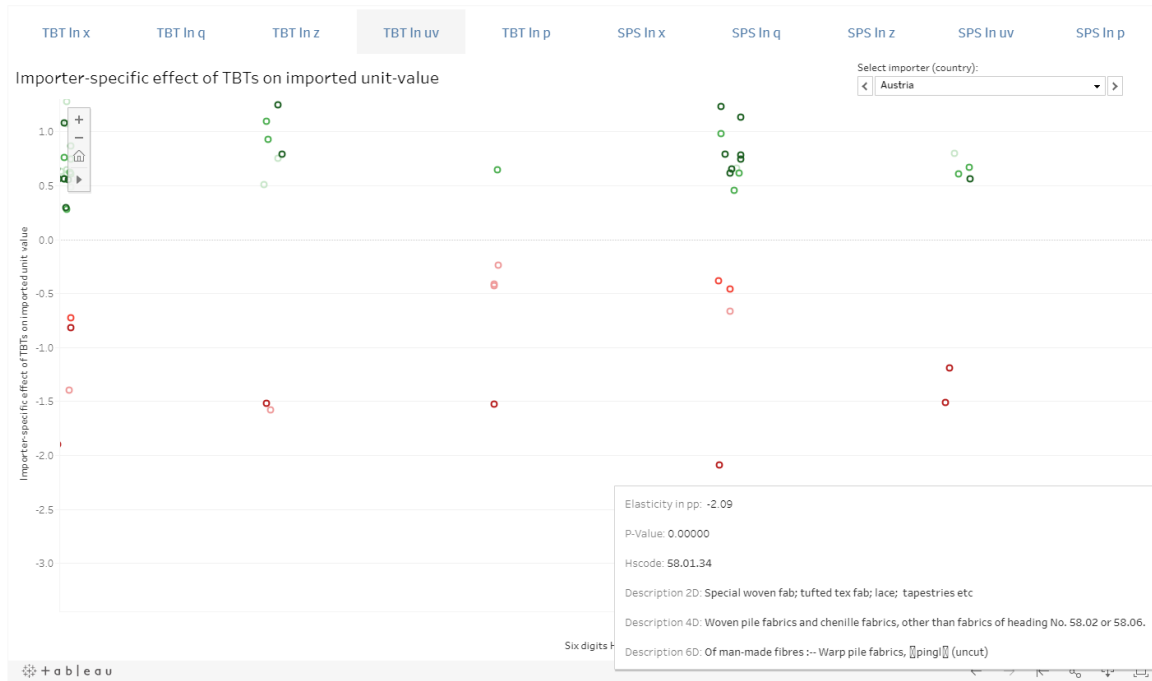
Figure A4 / Impact of TBTs on price of products imported to Austria during the period 1996-2017 (focusing on product 58.01.34)