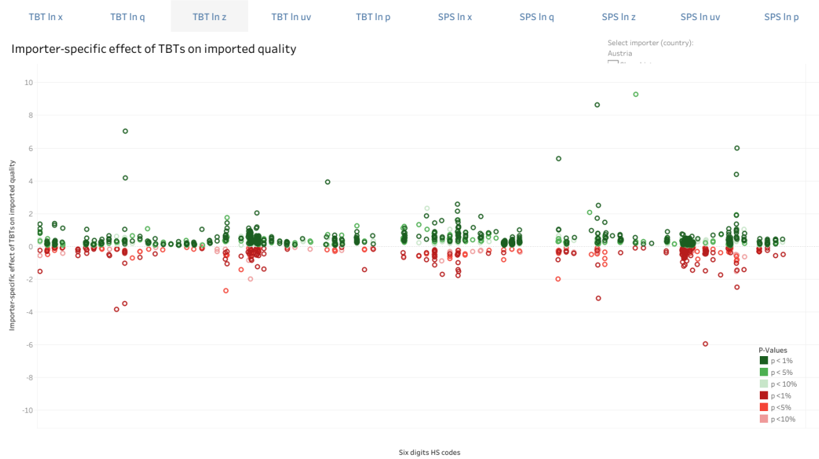
Figure A1 / Product-specific impact of TBTs on quality of products imported to Austria during the period 1996-2017