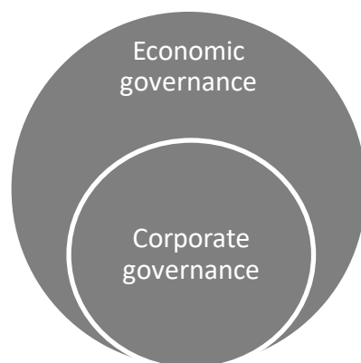
Figure 1: Stylised governance model

This paper examines how governments and companies can be jointly empowered to have a positive impact in terms of achieving the SDGs. The current economic system, which is largely geared towards maximising economic growth, might hold companies back in their attempts to balance profit and impact. For business to be purpose driven, broader change of the governance of the economic system (including institutions with long-term orientations) is necessary. The central premise of this paper is that the choice of governance for the economy and for the corporate sector cannot be studied in isolation (Figure 1). Corporate governance must fit within the broader economic system to be successful. This paper investigates the link between economic and corporate governance.