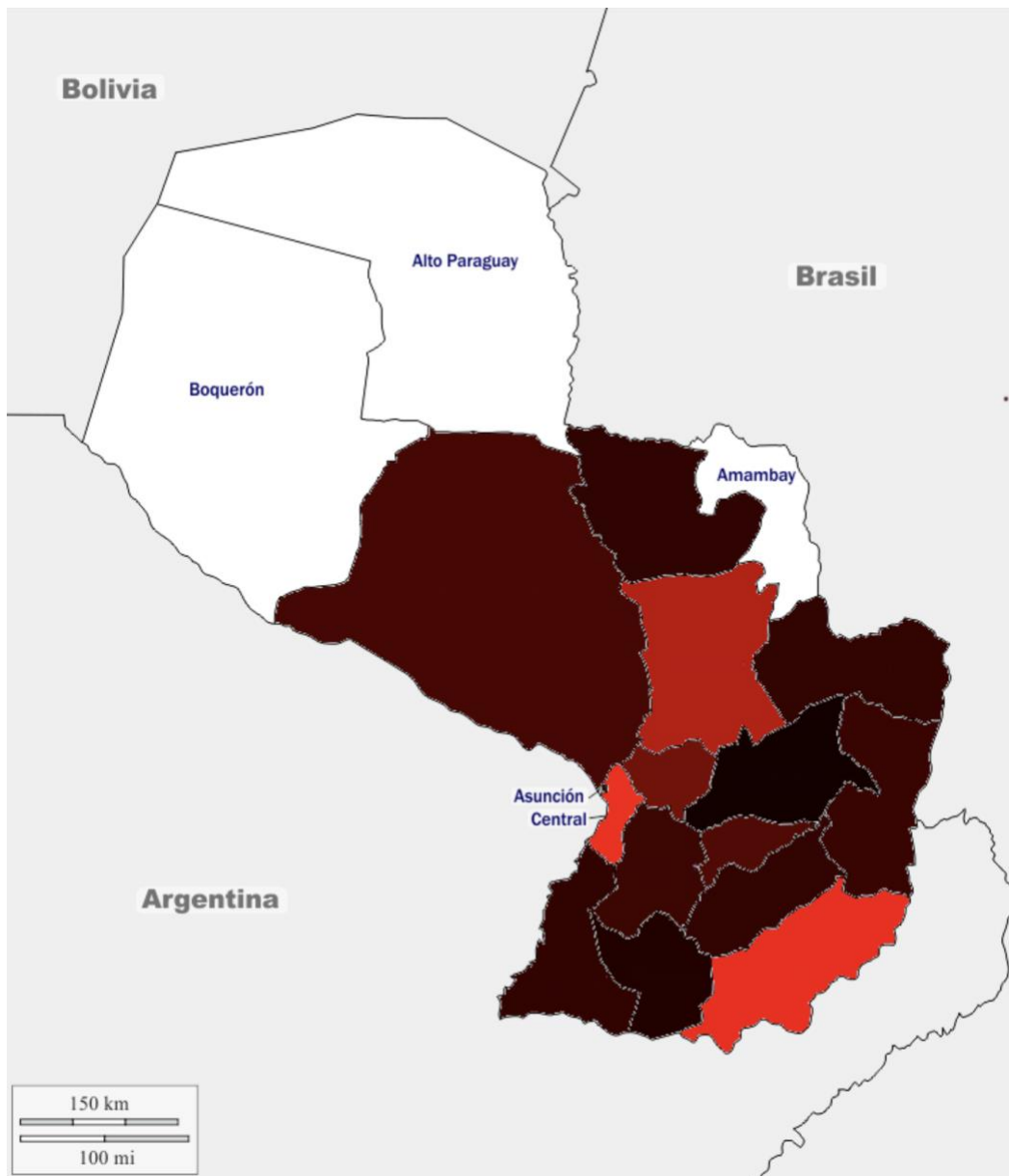
Figure B1. The departments show the distribution of beneficiaries across departments. Departments in brighter red represent those with the highest share of beneficiaries and those with darker shade the lowest share (Share ranged from 1 to 20 percent). The departments of Boquerón, Alto Paraguay, and Amambay were not sampled because less than 1 percent of the beneficiary population resided in these departments.

This appendix includes a map showing the location of beneficiaries in the country.