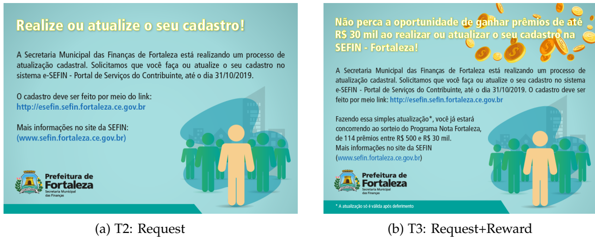
Figure 1: Treatment E-mails

Status Quo (T1). One group did not receive tax registry specific e-mail communications and represents the status quo, i.e. how the registry was advertised before the experiment. Its members may have learned about the registry via other channels. For instance, by browsing the Municipal Secretary of Finance’s website, which featured prompts to join the registry.