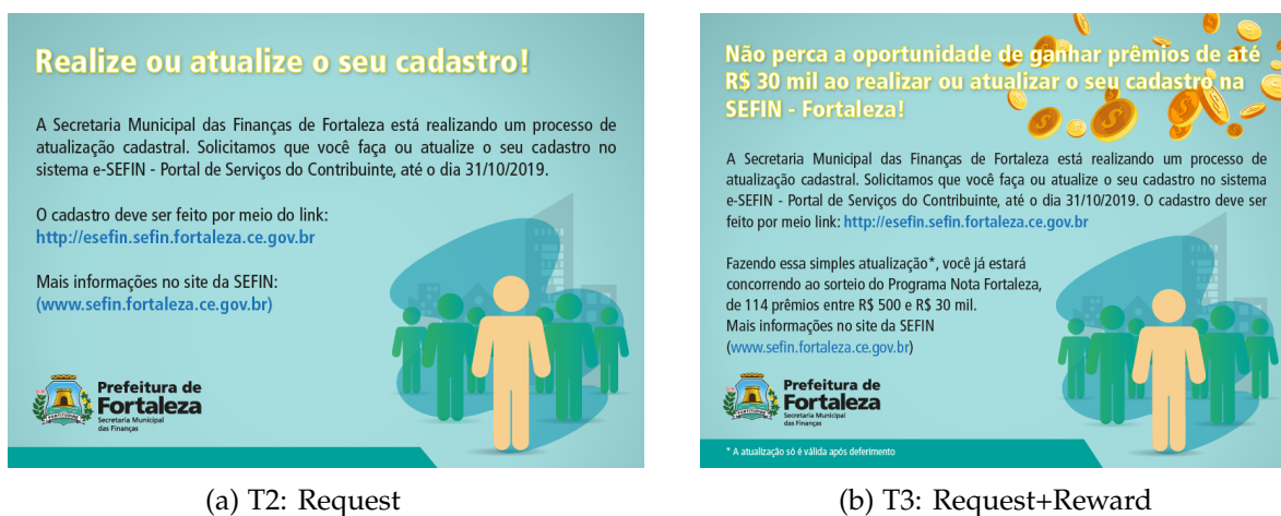
Figure 1: Treatment E-mails

Status Quo (T1). One group did not receive tax registry specific e-mail communications and represents the status quo, i.e. how the registry was advertised before the experiment. Its members may have learned about the registry via other channels. For instance, by browsing the Municipal Secretary of Finance’s website, which featured prompts to join the registry.