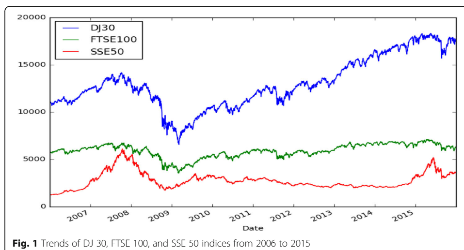
Fig. 1 Trends of DJ 30, FTSE 100, and SSE 50 indices from 2006 to 2015

We used the daily data for USDX, GBP/USD, and USD/CNY and the constituent stocks of the DJ 30, FTSE 100, and SSE 50 from Datastream (a financial database) from 2006 to 2015. Figure 1 shows an upward trend in the US stock market after the 2008 stock market crisis, a stable trend in the UK stock market, and two peaks, in 2007 and 2015,