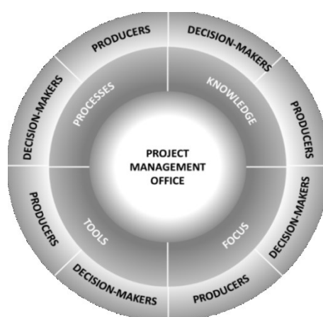
Figure 2. Holistic MPMI-PA

The holistic Model of Project Management Implementation in Public Administration (MPMI-PA) is built by layers and groups (Fig. 2).