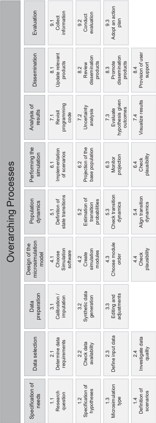
Figure 2: Generic business process model