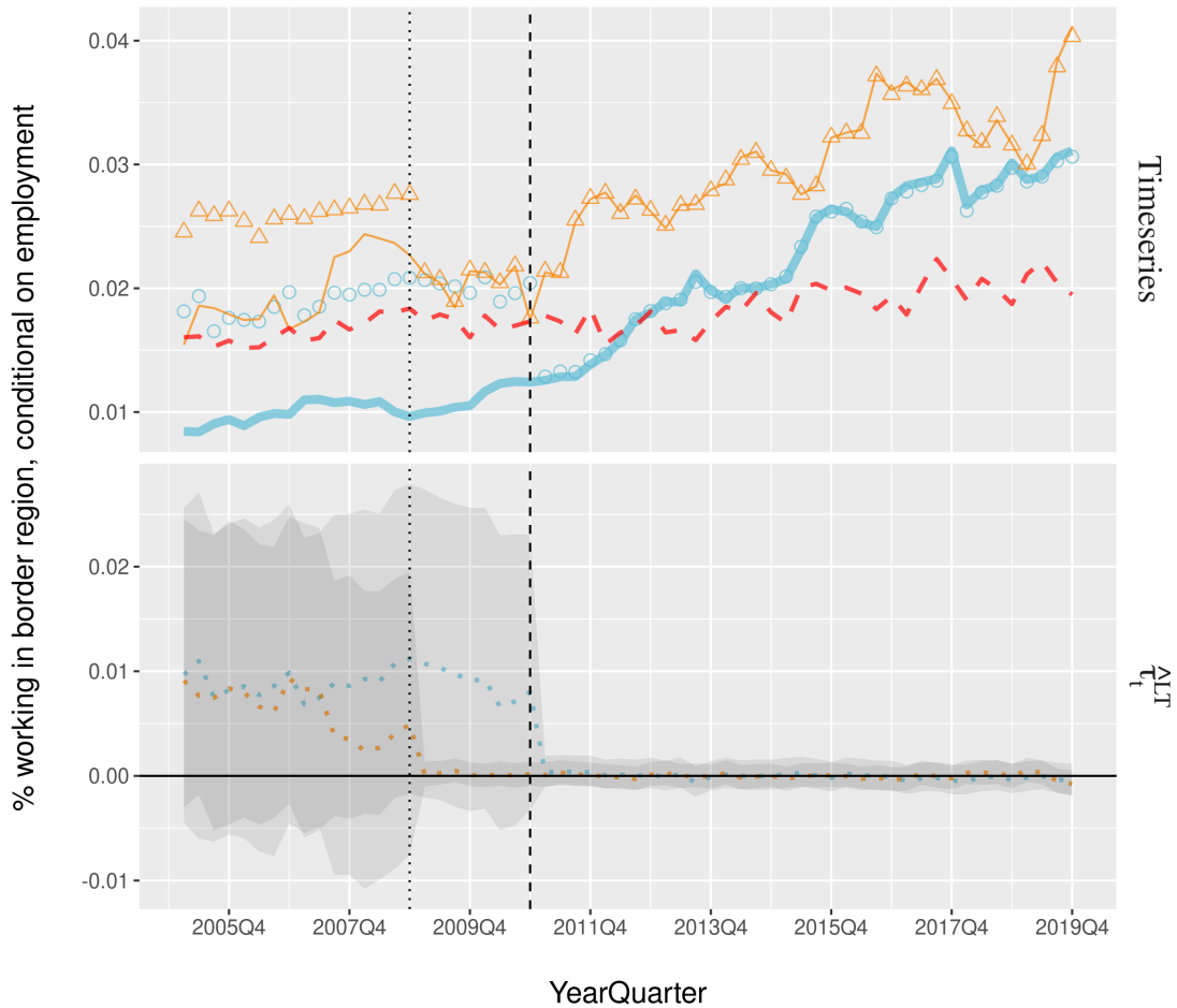
Fig. 2. Matrix completion estimates of the effect of combined treatment (Schengen + FoM) on share of residents working in another country, conditional on employment, for the later-treated regions ( N \times T = 53 \times 60 ). Note: The dashed vertical lines represent the initial treatment times of the combined treatment, T_0^{(\text{Eastern})} = 2011 and T_0^{(\text{Swiss})} = 2009 . The shaded regions are 95% bootstrap confidence intervals of the effects constructed with 999 block bootstrap samples. Key: —, observed outcomes of Eastern regions; —, observed outcomes of Swiss regions; - - -, observed outcomes of always-treated regions; ○, counterfactual Eastern; △, counterfactual Swiss; ·····, \hat{\tau}_t^{\text{Eastern}} ; ·····, \hat{\tau}_t^{\text{Swiss}} .