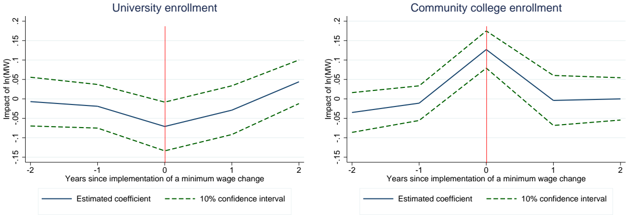
FIGURE 2 Distributed lag model

et al., 2019; Meer and West, 2016). To ease the interpretation of the results, the coefficients from this column are plotted in Figure 2. Note that the minimum wage has a contemporaneous (i.e. within the year) effect on university and community college enrollment. This is in line with Neumark and Wascher (1995a) who find a contemporaneous effect of the minimum wage on American high-school enrollment. In Canada, student surveys reveal that about 25% of high-school students do not make their post-secondary decisions until grade 12 or later (King and Warren, 2006). Even among those who make PSE decisions early on, many change their preferences along the way. 23 Therefore, it is not surprising that the minimum wage has a contemporaneous impact on schooling decisions. In addition, the one-year lag coefficient in column 3 reveals that the impact on university enrollment lasts up to the following year, although this effect is small and insignificant compared to the contemporaneous effect (i.e. -0.029 compared to -0.071 respectively). The impact on community college enrollment is more short-lived and disappears quickly within a year. Further, the minimum wage does not encourage enrollment before the new rate is implemented, as one would expect.