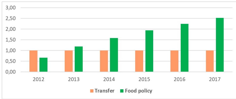
Figure 2: Relative effects of policy interventions triggering peace

possible to stabilize the economic growth rate of Syria by an amount of money equal to 5% of the Syrian GDP in 2012, then this would lead to an increase of the economic growth rate of 2012 by 0.04 pp. For the same amount of money (5% of GDP in 2012) invested in increased in food production it would add 0.07 pp on food production in 2012. Therefore, proper food policies that enhance food security seem to play a role toward peace.