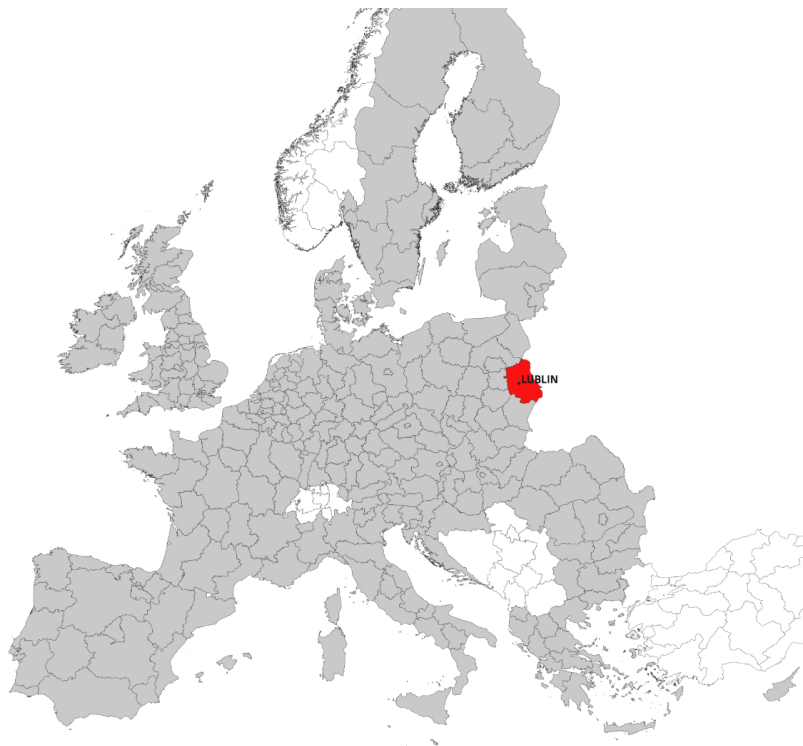
Figure 1: Location of Lublin and Lubelskie Voivodeship in the European Union

the same time one of six voivodeships in Poland clearly struggling with depopulation since Poland's accession into the EU.